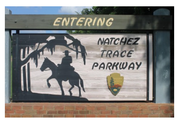
Day 13: Thursday, May 9th - 60 miles, 2895 ft.

We are staying east of the Tennessee River as we roll through more farmland and forest most of the day. Lunch in hospitable Collinwood, skirt by the Natchez Trace and finally scream dow to Waynesboro.