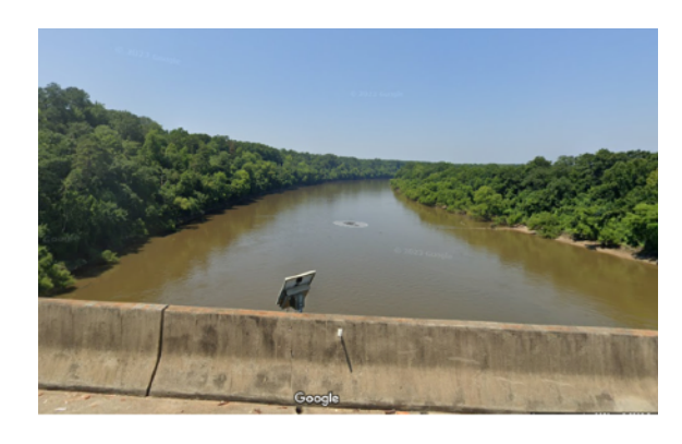
Day 4: Tuesday, April 30th - 62 miles, 2625 ft.

We leave the gulf coast and head north with this pure water spring at our morning stop.