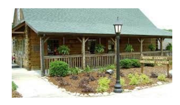
Day 12: Wednesday, May 8th - 51 miles, 2800 ft.

We are staying east of the Tennessee River as we roll through more farmland and forest most of the day. Lunch in hospitable Collinwood, skirt by the Natchez Trace and finally scream dow to Waynesboro.