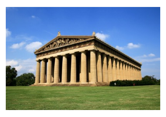
Day 15: Saturday, May 11th - 47 miles, 3151 ft.

We head back to Leipers Fork the same way through Franklin. We continue our trek on the Natchez Trace all the way to the outskirts of Nashville. Time to relax and be a tourist. Lunch at Loveless Cafe, Belle Meade, the Parthenon, and downtown. Group dinner at Pucketts and then Broadway!