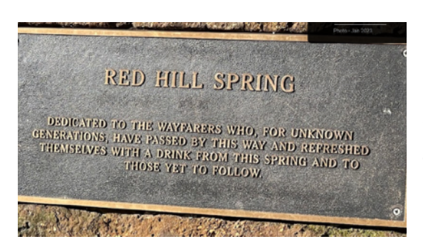
Day 3: Monday, April 29th - 65 miles, 3023 ft.

We leave the gulf coast and head north with this pure water spring at our morning stop.