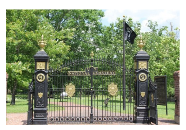
Day 10: Monday, May 6th - 71 miles, 2700 ft. Toward the end of the ride we'll be skirting through the south end of the Civil War Shiloh Battlefield and our afternoon stop at the Visitor Center on the north end.