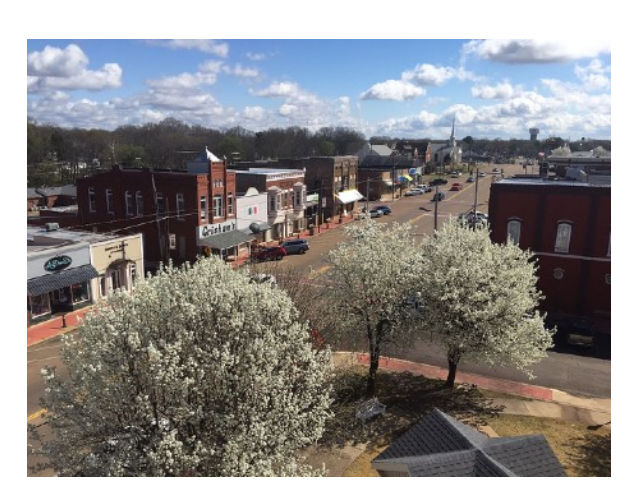
Day 11th: Tuesday, May 7th - Rest Day A well deserved day off in Savannah, Tennessee! Go back to the Shiloh Battlefield. Also, The Tennessee River Museum and US Grant's Cherry Mansion.