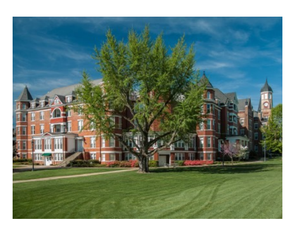
Day 7: Friday, May 3rd - 93 miles, 3135 ft. Back to work! A long day but this might just be one of your favorite days. Flat, quiet roads and scenic. A perfect cycling day and we cross into Mississippi!