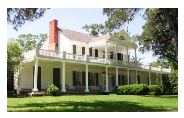
Day 5: Wednesday, May 1st - 71 miles, 2877 ft.

We pass through countless pine forests and cross the Alabama River.