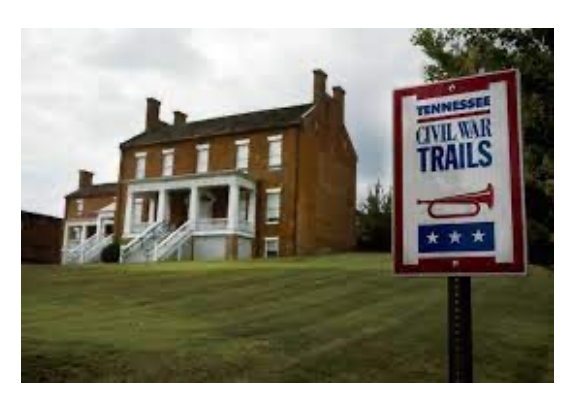
Day 14: Friday, May 10th - 58 miles, 3900 ft.

Today we head east for 10 miles and hop onto the Natchez Trace. There will be a few sites to stop at along the way. After lunch we turn onto Mt. Joy Road and climb "Mount Joy" before heading into Columbia.