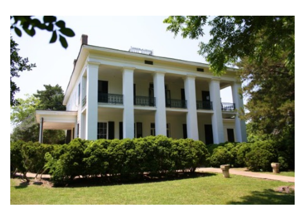
Day 6: Thursday, May 2nd - Rest Day

Welcome to plantation country, so they say. Today will be a trek to reach the next lodging spot. Green everywhere you look. We'll be staying outside Demopolis, a very historical city. 94 mi, 4389 ft